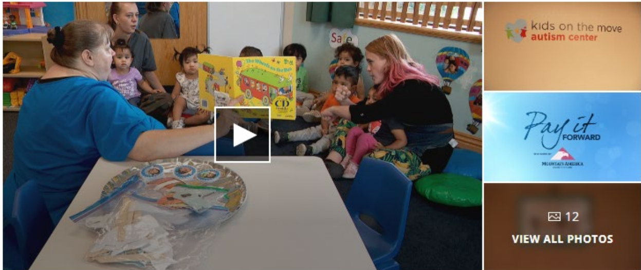
Pay it Forward: Utah County nonprofit hopes to 'empower' families by providing them extra support

OREM, Utah (KUTV) — A Utah County nonprofit provides extra support to low income families or families who have children with special needs or disabilities.